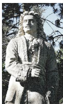
Antoine De La Mothe Cadillac